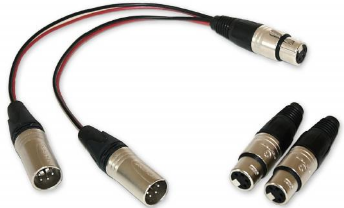
DPS-12 Male connectors pinout

The DPS-12 (+12V) and DPS-48 (48V) kits add power supply redundancy to the Davicom units by allowing two power supplies to be connected in parallel, ensuring a fail-safe operation in case of supply failure.